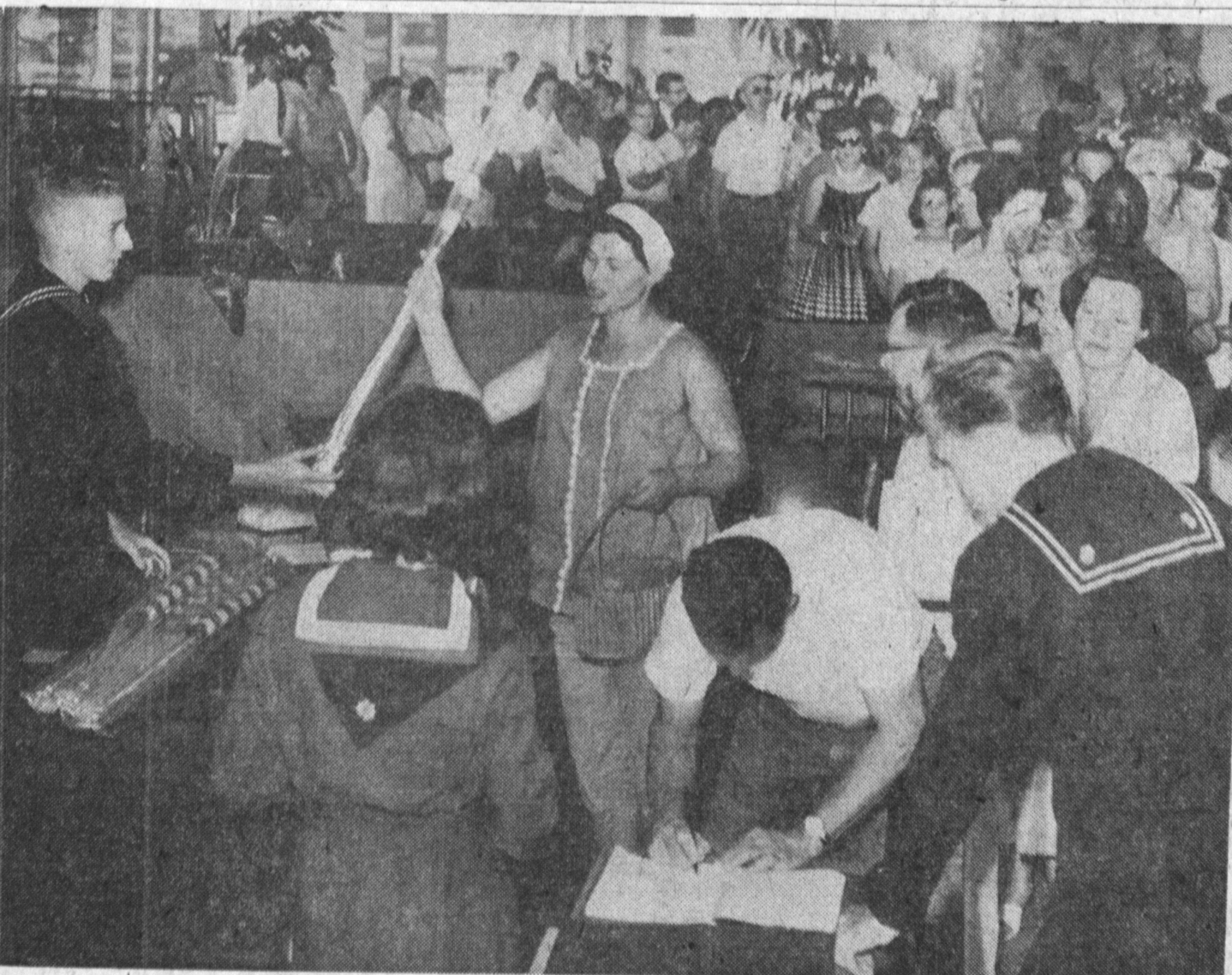
CITIZENS RUN FOR FREE FLAGS —More than 5000 flags were given out by Marina Federal Savings and Loan Association in response to an announcement of free distribution to adult citizens. Local Sea Explorers and Mariners handed them out from the foyers of the two offices of this savings and loan