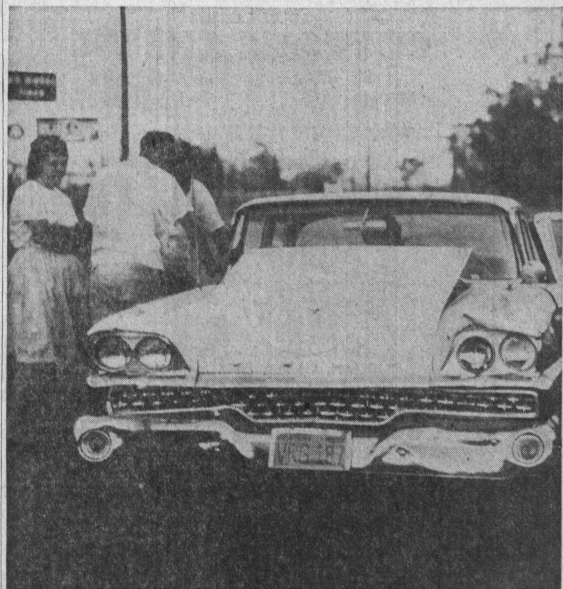
FENDER BANGER—A jurisdictional problem between Torrance police and sheriff's deputies developed Thursday evening when a minor accident occurred exactly on the dividing line of the two districts. City limit line runs down the center of Western Ave. on the

east side of Torrance. Accident took place in the exact center of Sepulveda and Western intersection. Local police answered the call first, finally turned issue over to deputies for disposition.