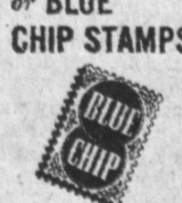
Choice of one gift... or Blue Chip Stamp. Limit... 1000 stamps one gift or stamp allocation per customer