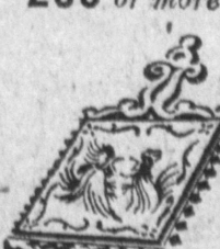
Hand-Painted Tile Trivet