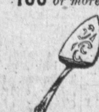
Wm. Rogers Silver Pastry Server