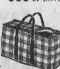
15-inch Insulated Plastic Picnic Bag