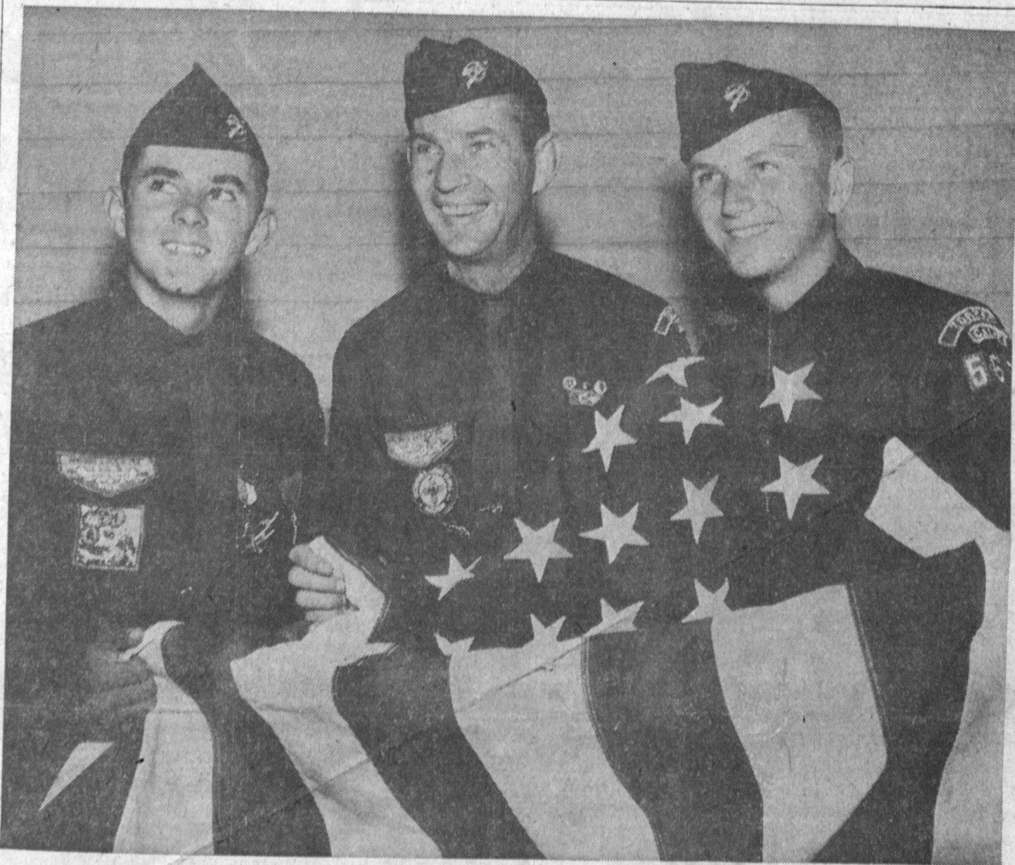
JULY 4 PRESENTATION —Members of Explorer Post 565 last week were presented with a huge American flag that has flown over the White House by Senator Thomas Kuchel. Youths thought it was only fitting that the flag be raised on Independence Day and will present it to the directors of Normandale Playground, 224th St. and Halldale, during im-