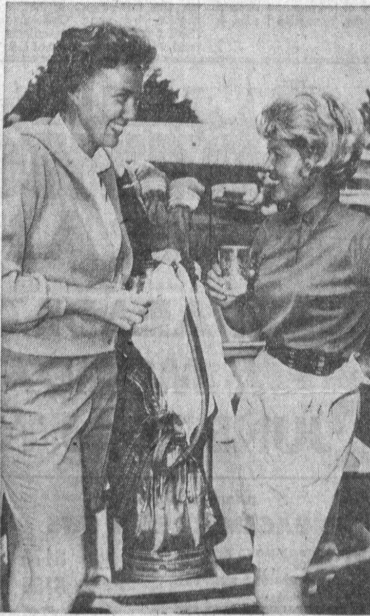
SPORTS SPECTACULAR-Lady golf pros meet their male peers in "Golfing Battle of the Sexes" seen Thursday on CBS-TV, Channel 2 at 7:30 p.m.