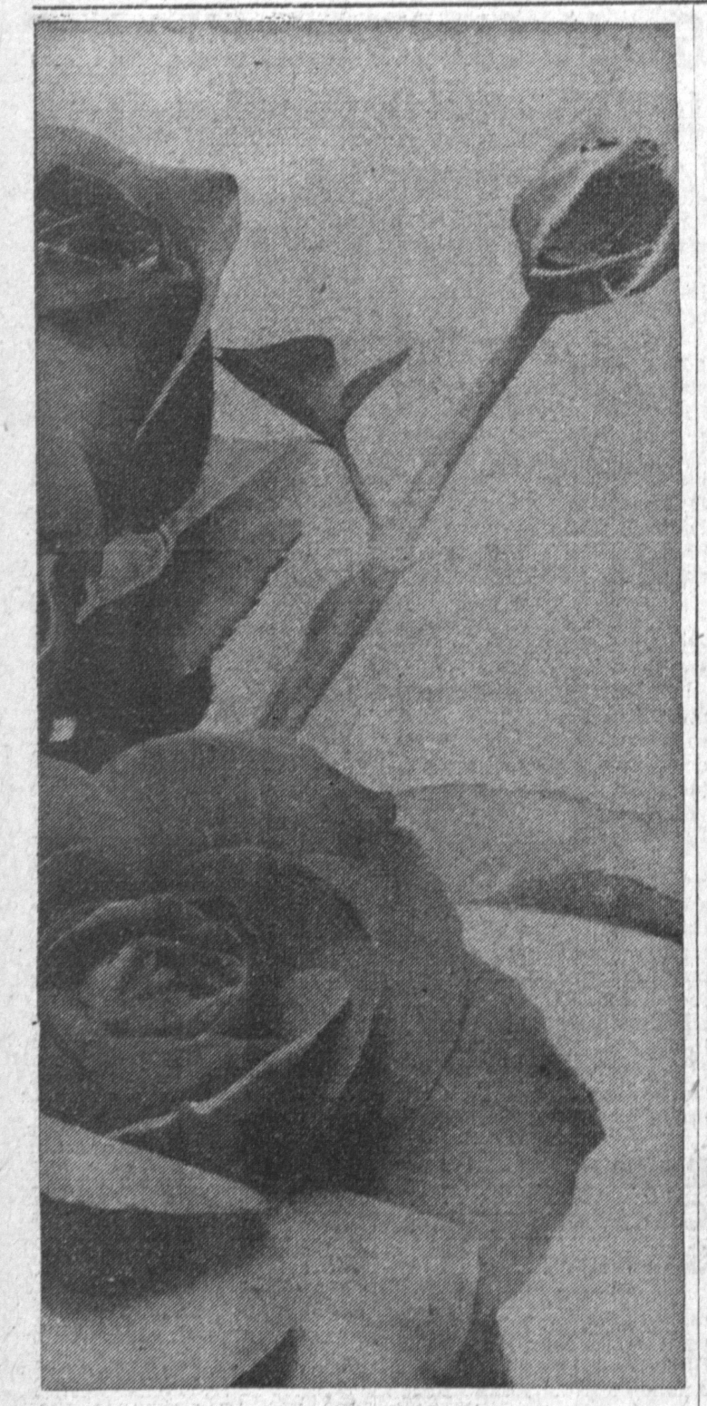
JOHN S. ARMSTRONG, 1962 All America Rose Selection, is only the fourth Grandiflora to capture this coveted award. Its distinctive, deep velvety red flowers, which range up to 4 inches across when fully opened, tre truly color fast in every stage. Unlike most dark red roses, they wil not burn or assume a bluish hue. Flowers are borne in clusters with long individual stems that make them ideal for cutting.