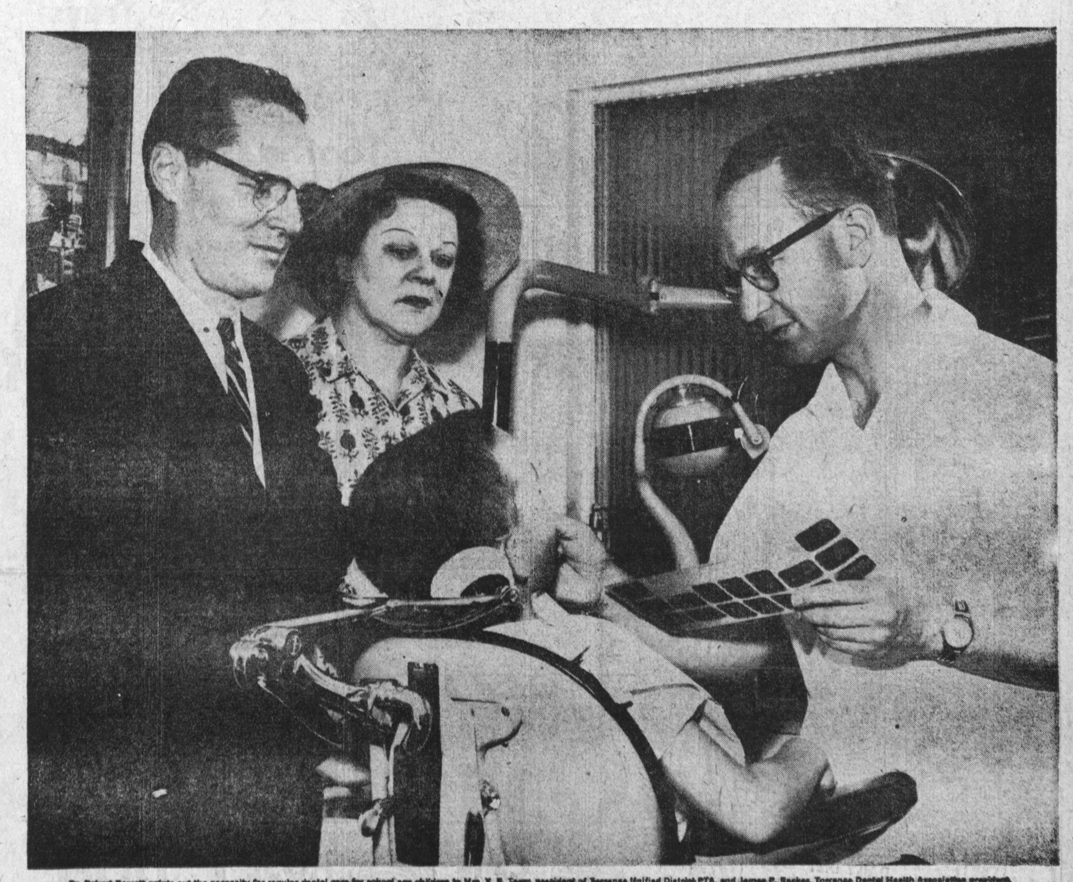
a local solution to a local problem

Dental care for Torrance school children who need but cannot afford such work is the goal of the Torrance Dental Health Association.