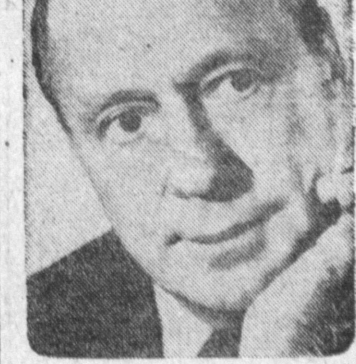
Laugh with the world's most careful buyer, presented by your State Farm agent! And find out how you stand to save with State Farm's low rates for careful drivers. Contact me today.