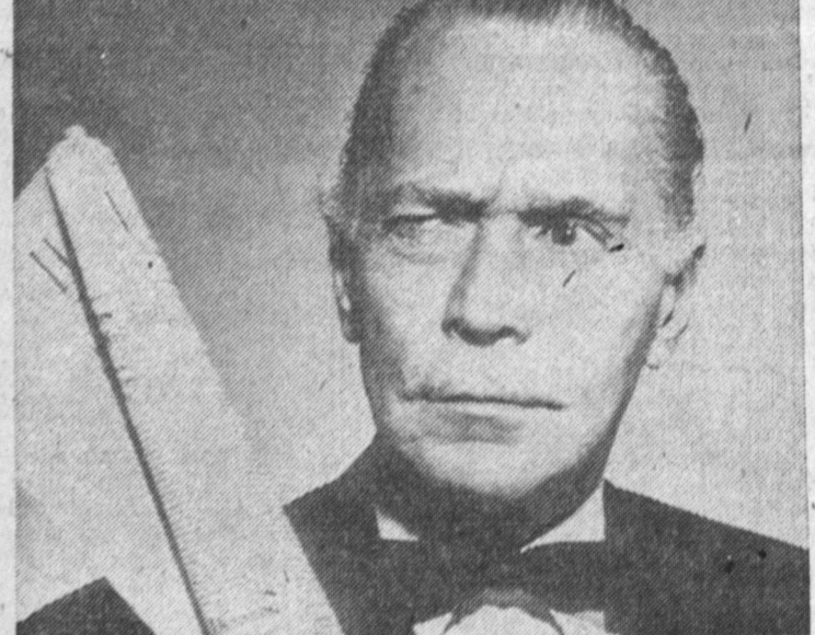
TWILIGHT ZONE-Franchot Tone stars as a self-centered man who makes an incredible wager in "The Silencer," to be seen Friday at 10 p.m. on CBS-TV, Channel 2.