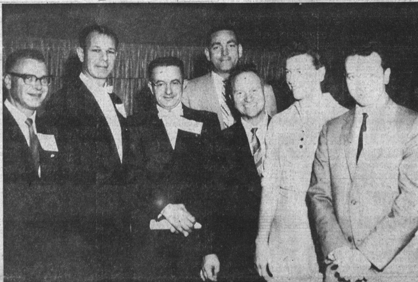
READY FOR ELECTION—Group of candidates and incumbents to the Torrance school board, who have attended virtually all of the 70-plus study and discussion group sessions set up by interested parents and taxpayers, posed briefly for

The nearest Franchise office is 3905 Atlantic Ave., Long Beach. For further information, call GA 6-2553.