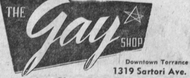
Phone FA 8-4563 Open Fridays 'Til 9 P. M. Honor Bankamericards and International Credit Cards

In cotton pinchecks. A slim sheath dress, with self belt. Complemented by a neat boxy jacket, notch lapels in 3/4 long sleeve. By For-ever Young. Sizes 141/2 to 221/2.