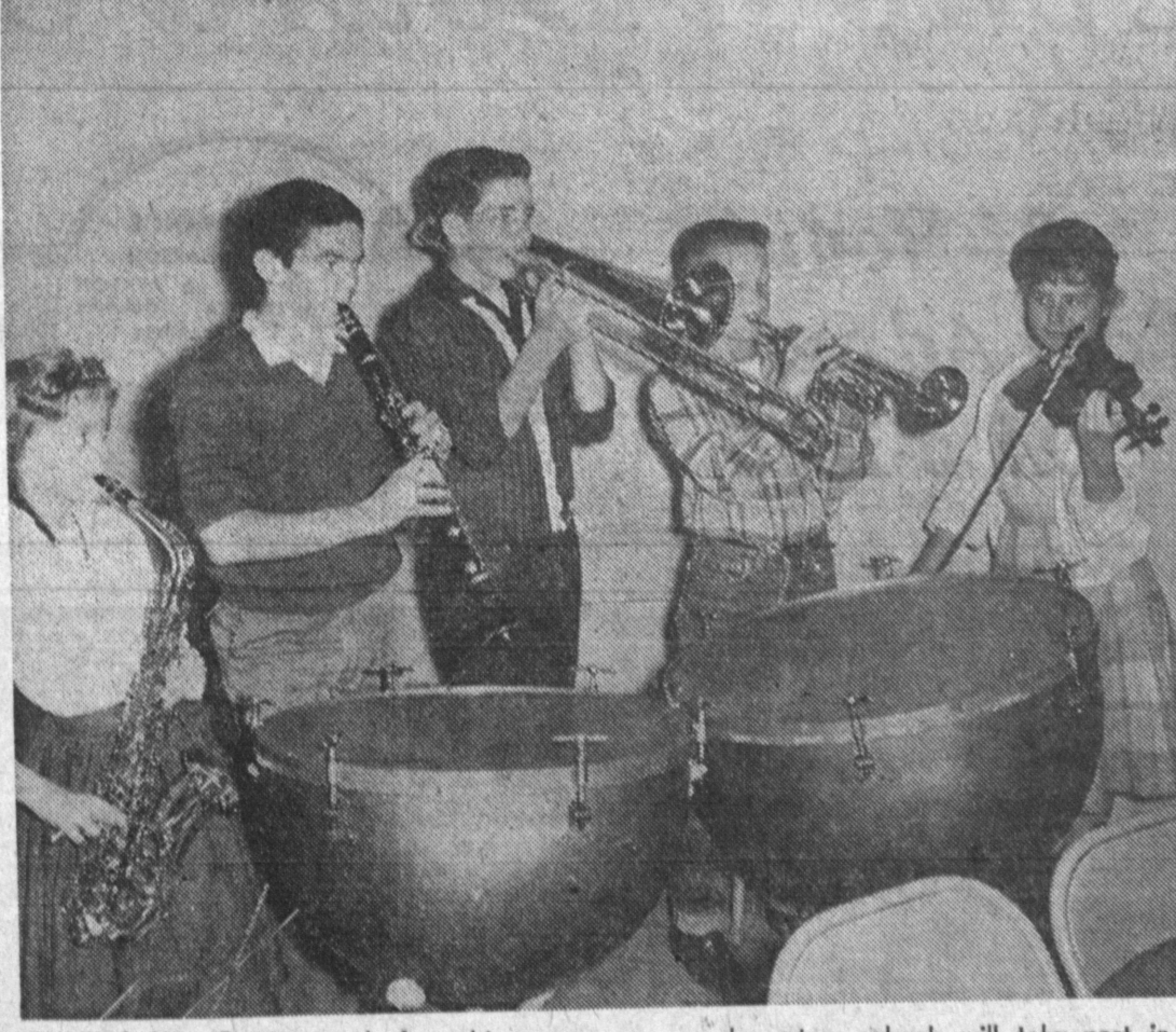
TUNING UP-Getting ready for a big concert Friday night at 8 in the North High Gymnasium are these Edison School students. Some 300 instrumentalists from 12 north Tor-