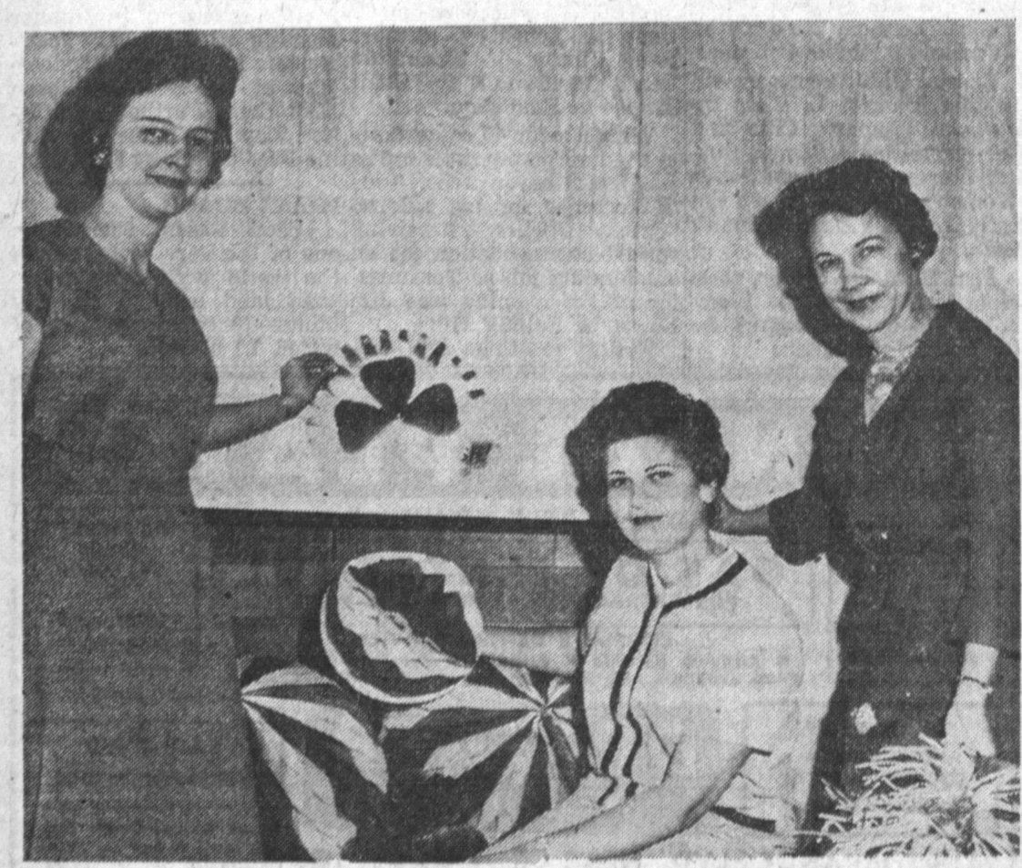
SETTING FINAL PLANS-Members of the South Bay Pharmaceutical Association and the Women's Auxiliary are putting the finishing touches on dance plans for the Shamrock Ball. The gala affair will be held March