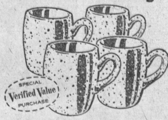
FAMILY SIZE For dining room, kitchen, "rec' room or patio use.