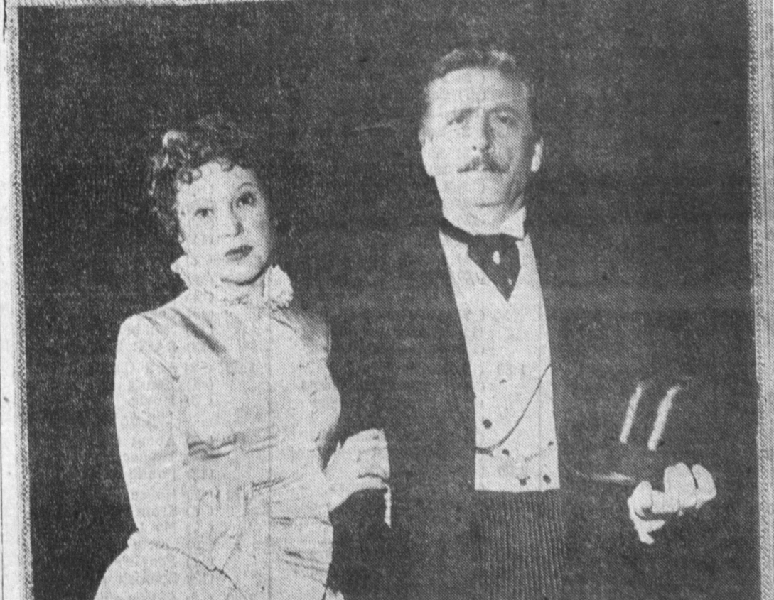
OLD FASHIONED? Lurene Tuttle and Leon Ames portray Mother and Father Day, stars

"Hong Kong" with added in-terest. After all the gals are stacked a hell-of-a-lot better HANDSOME