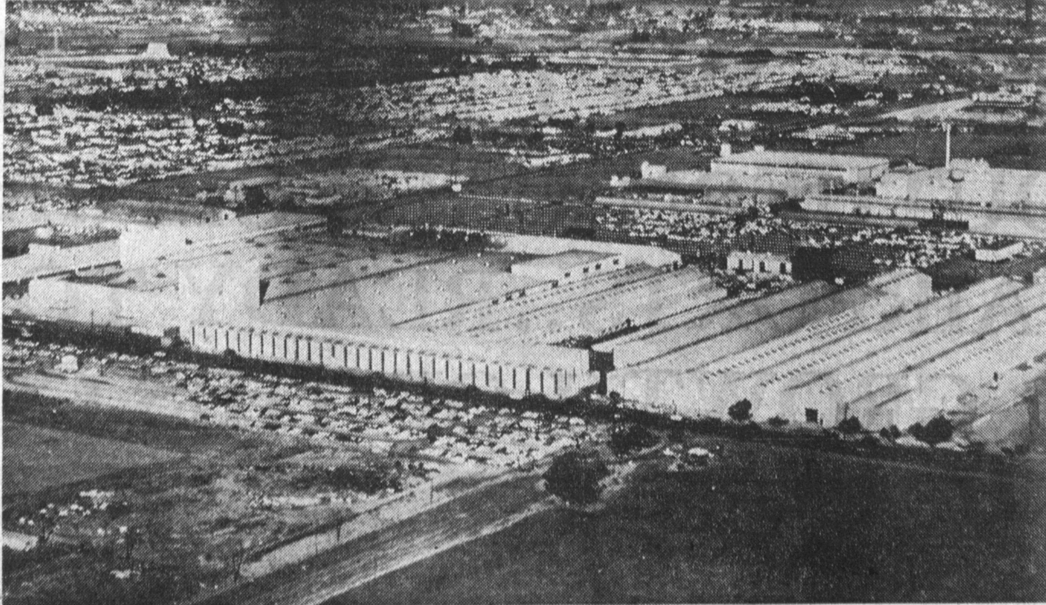
COMPLICATED PROCESS-Primary metal, reduced directly from the original ore at Harvey Aluminum's reduction plant at the Dalles, Ore., is shipped to the company's Torrance