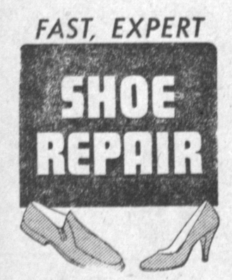
Shoe repair means extra wear! Our expert repairs and fast service save you money!

"Luck is good planning, carefully executed."-American Salesman.