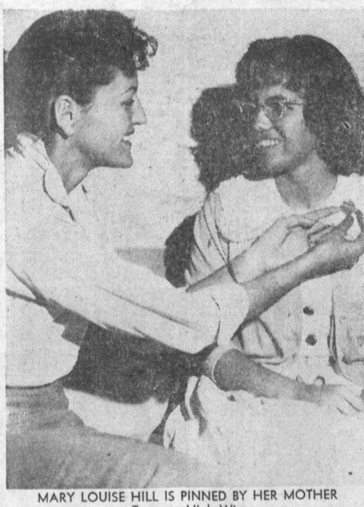
.. Torrance High Winner