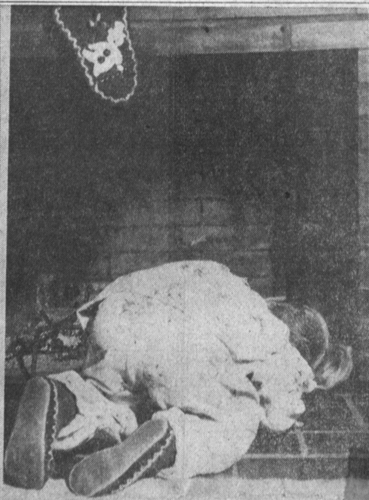
all night waiting for the arrival of the good saint may speak to