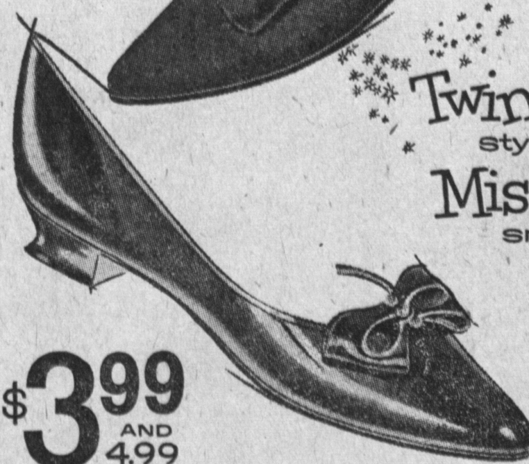
Swivel Strap Style. Nylon velvet or black patent. $3.99