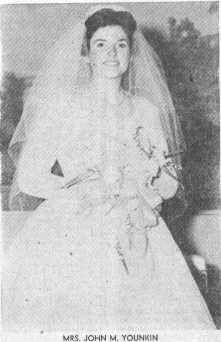
... nee JoAnne Haygood

Architects know how to achieve great charm with the use of simple materials like the combination of a fireplace of old brick and a paneled wall of western red cedar in a family room.