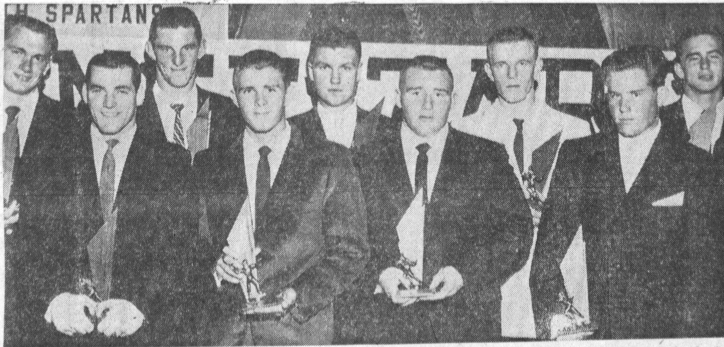
LAST YEAR'S WINNERS—Deadline to vote for selection of this year's All-American City Football Team is Wednesday, Nov. 30. Local sports enthusiasts are asked to fill out the form appearing in the lower portion of the Torrance Press' sports page and either bring it in or mail it to the Sports

Use classified ads for quick results. Phone DA 5-1515.