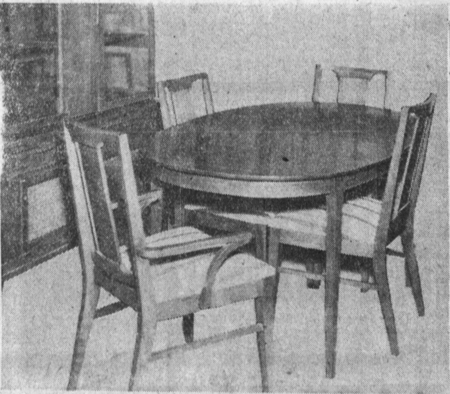
ELEGANT OVAL DINING SET. Very chic cane back chairs and spacious china complete with 2 arm chairs and 4 side chairs. 398.00