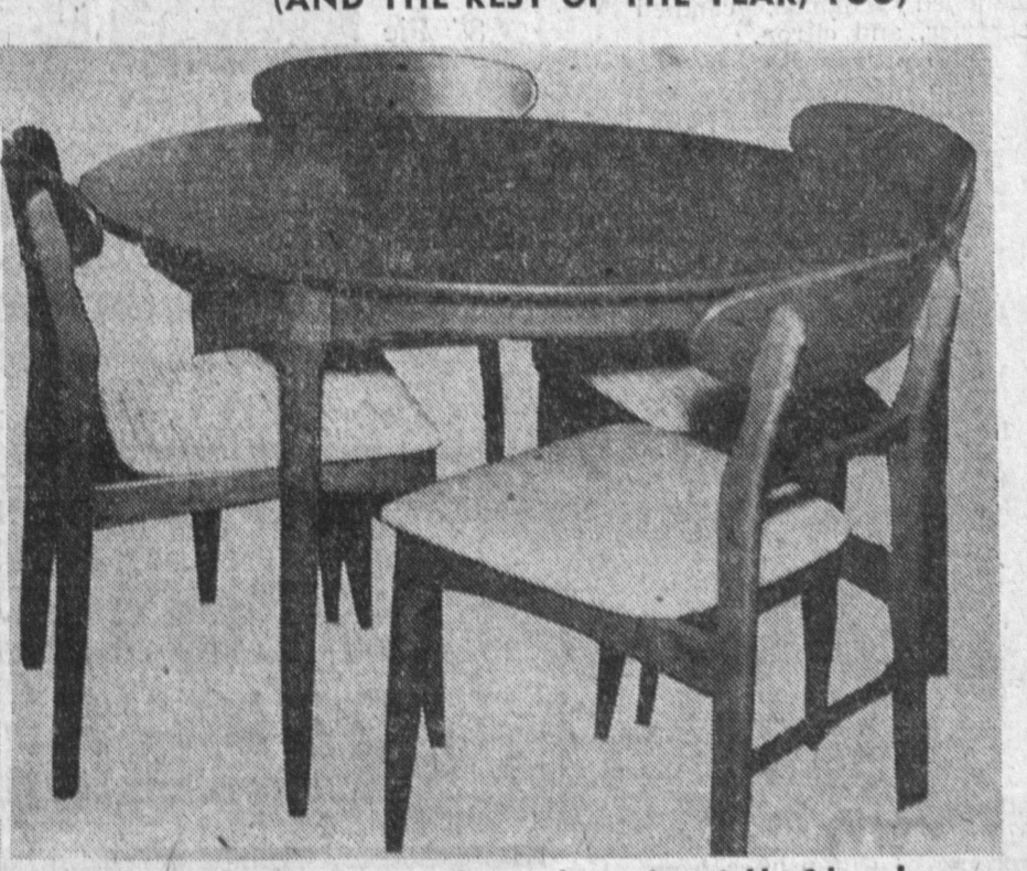
DANISH MODERN. Ever popular round extension set. Has 2 large leaves. Matching buffet available. 5 pieces. Only 187.00