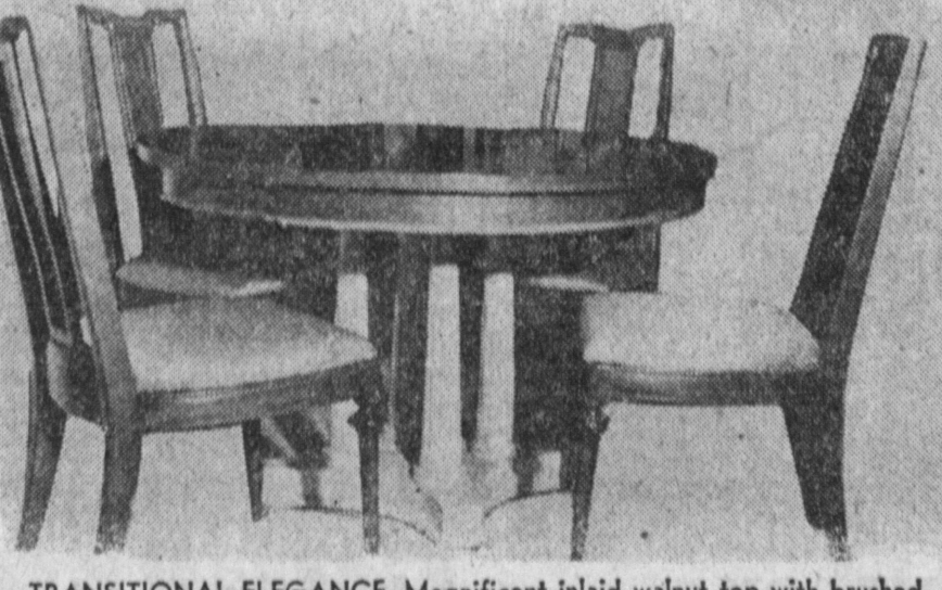
TRANSITIONAL ELEGANCE. Magnificent inlaid walnut top with brushed white base. Handsome, handwoven cane backs as shown. Other matching pieces available. Table shown has two fills with matching apron. All 5 Pieces $295.00

MONEY BACK GUARANTEE If you buy furniture from alpert and find it for less elsewhere within 30 days, we will refund the difference in cash. 1. Merchandise must be tagged with lower price. 2. Merchandise must be within 20 mile area. 3. Our Comparison Shopper must verify all claims.