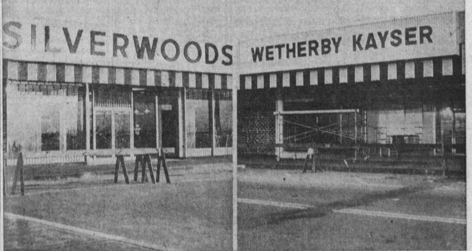
OPENING DAY CEREMONIES—Prominent local officials and representatives of community organizations will be present tomorrow noon for the opening day ceremonies of the beautiful new Silverwoods Store in Del Amo Center, and the equal-