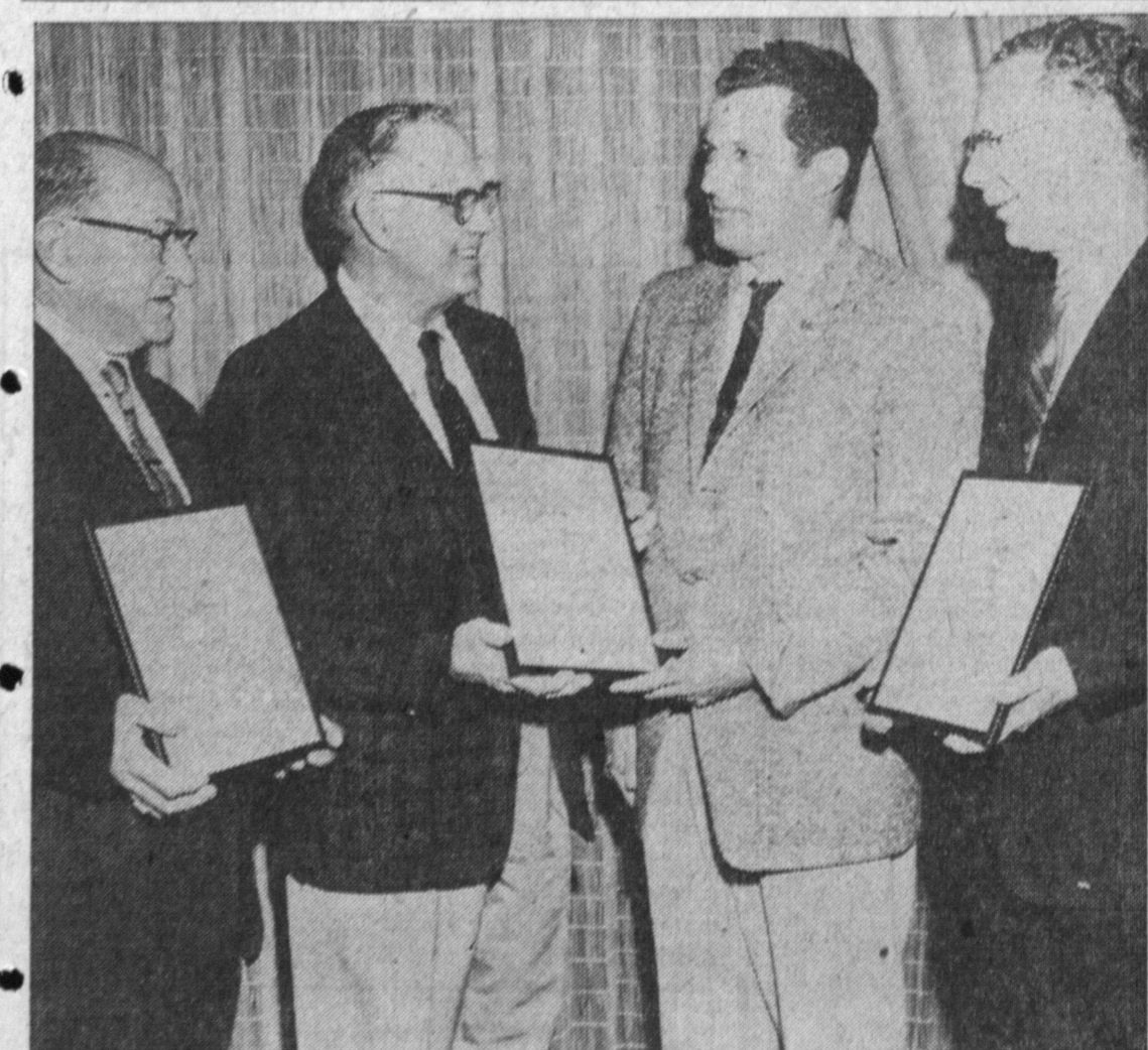
SCOUT EXECS HONORED--Torrance scouting officials were honored during last week's 38th annual meeting of the Harbor district at the Hacienda Hotel. Shown receiving Awards of Merit for their scouting activities

Henderson also noted that the city needed a central library building of about 20,000 square feet floor space, which would include an adult reading