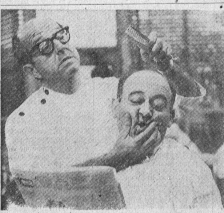
CANDID CAMERA-Phil Silvers turns up as a barber in Manhattan, Sunday night on Channel 2 at 10 p.m.