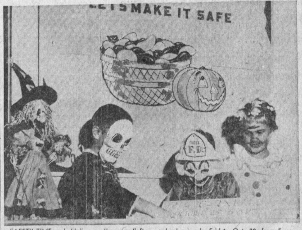
The PTA is sponsoring a carnival on the

school grounds, Friday, Oct. 28, from 5 un-