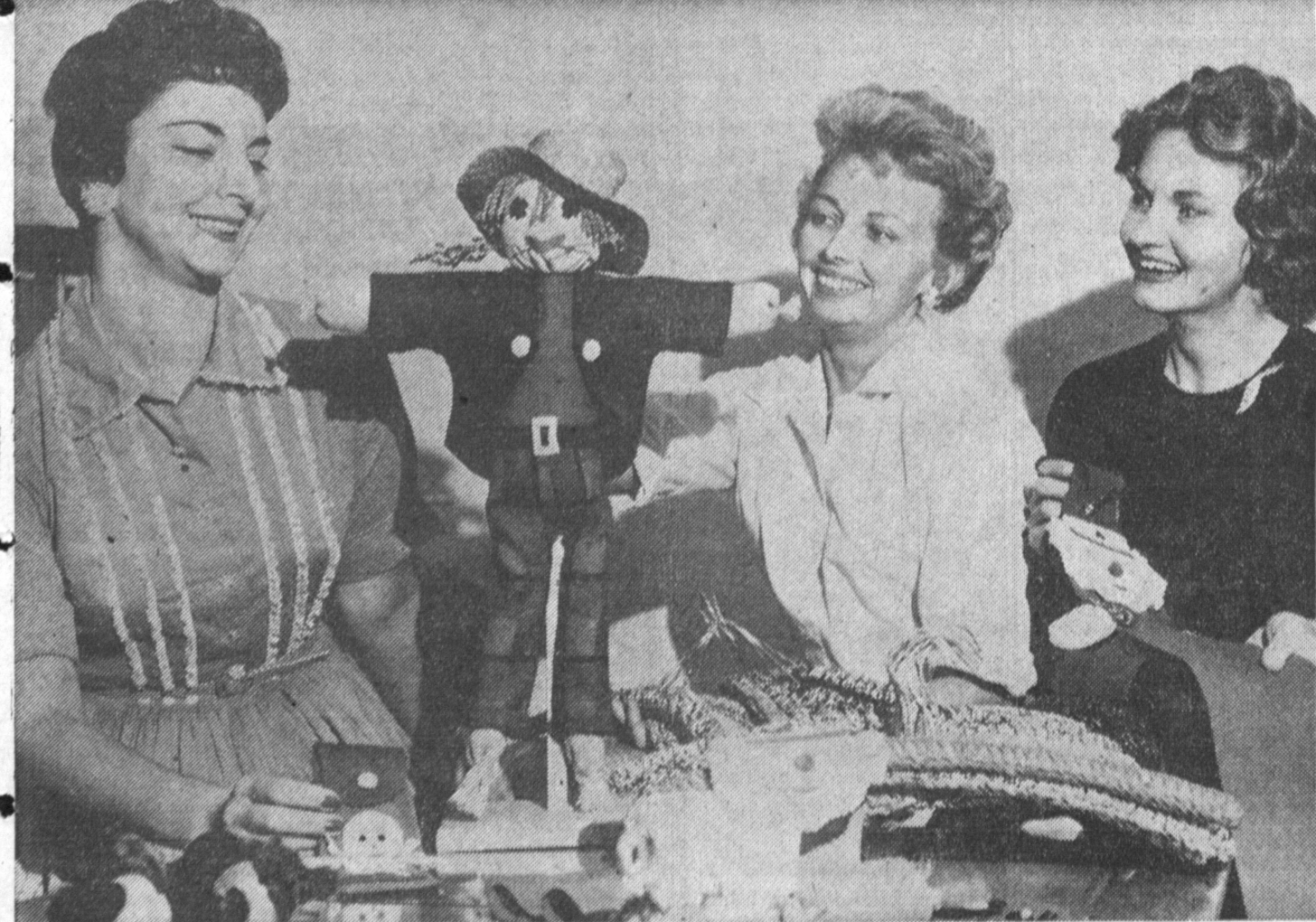
TOY PARTY — Plans are being made by the Torrance Junior Woman's Club for a toy party to be held at the clubhouse, 1422 Engracia Ave., Oct. 26, 8 p.m. Helping with the ar-