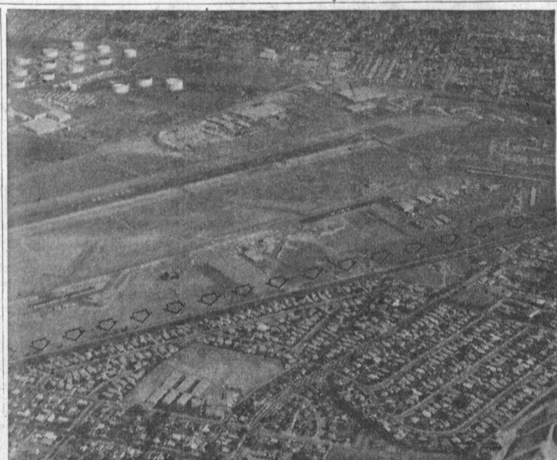
BIRD'S EYE VIEW - The Torrance Airport, gateway to industrial growth here, is in line for a "front porch" of fine buildings facing Highway 101, should a master architectural

"The Board had not even nized carefully and critically