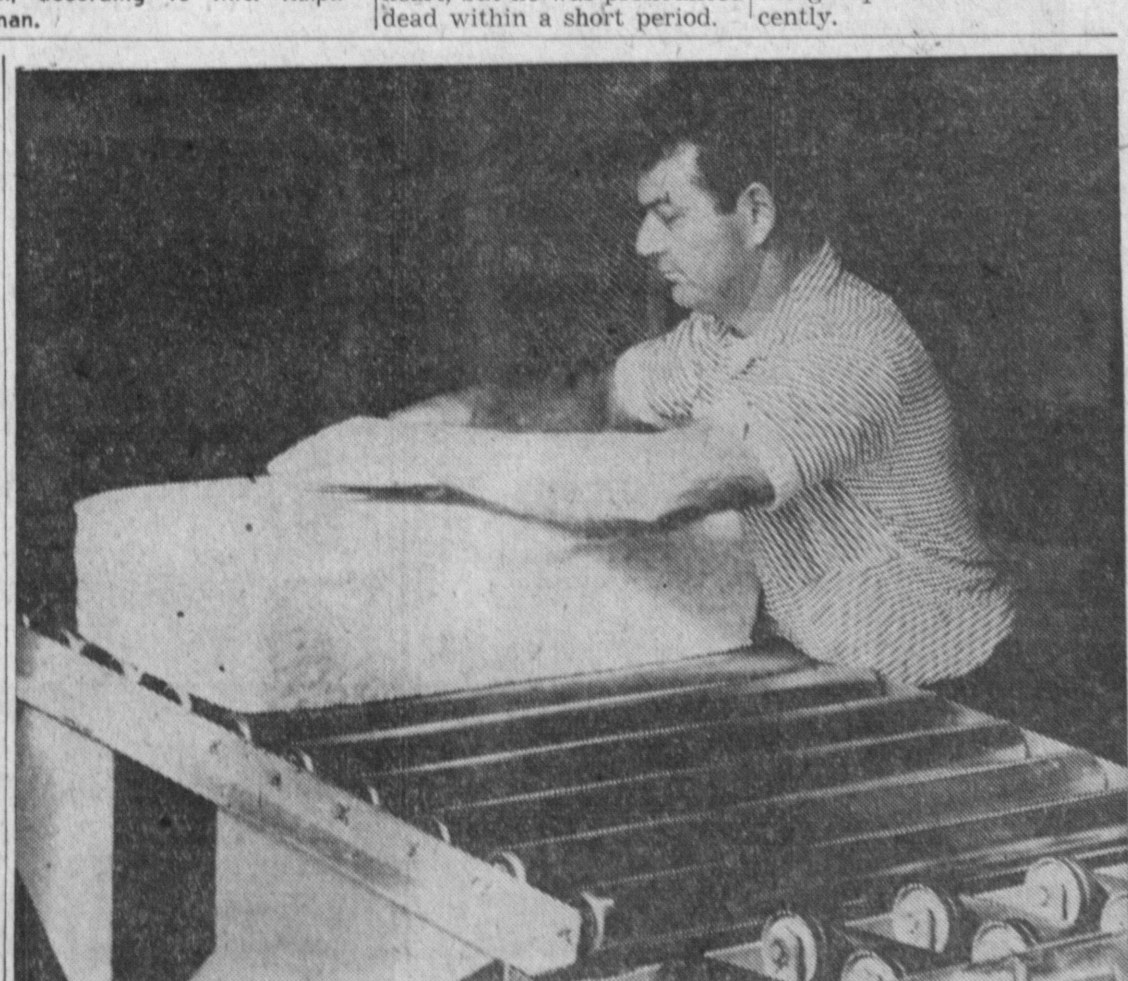
HRST IN THE WORLD-An operator examines a bale of Shell Isoprene Rubber, the man-made equivalent of natural made only here in the Torrance plant.

At least a year ahead of any Natural ruber is subject to Expansion of the polyiso-competitor in the world, ac-contamination from particles pere production capacity cording to officials, Shell's of dirt, dust, bark and sand.