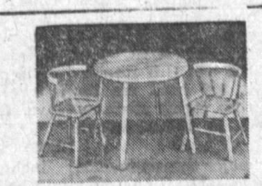
TABLE and CHAIRS

Beautifully polished Tawn Hardwood Table and Chairs. Table 211/4" High, 25" diameter. Chair 21" high.