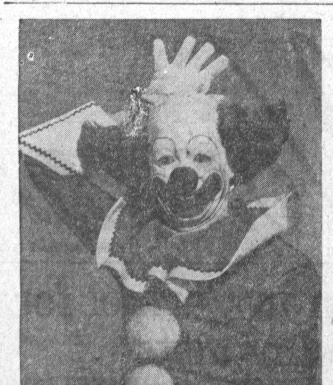
'BOZO' TO MAKE PERSONAL APPEARANCE AT

"Bozo," the bulb-nosed, big-footed buffoon who stars on KTLA's "Bozo, the Clown," Monday through Friday, 6:00 p.m., will appear in person at Toy King on Saturday, October 15, 1960,