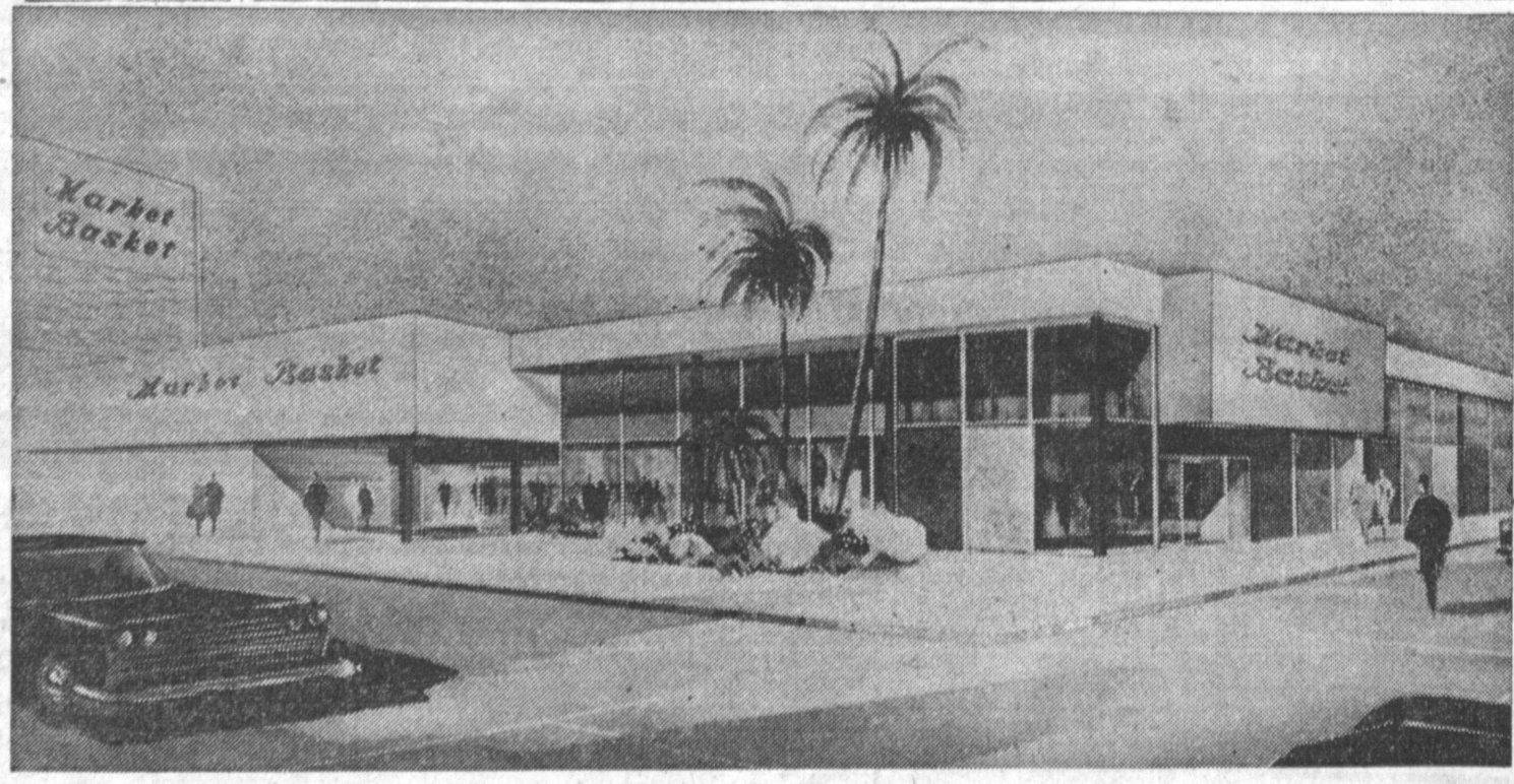
FIRST IN AREA—Groundbreaking ceremonies today marked the beginning of construction for a bran dnew Market Basket Supermarket, at 182nd St. and Hawthorne Blvd. It is the chain's