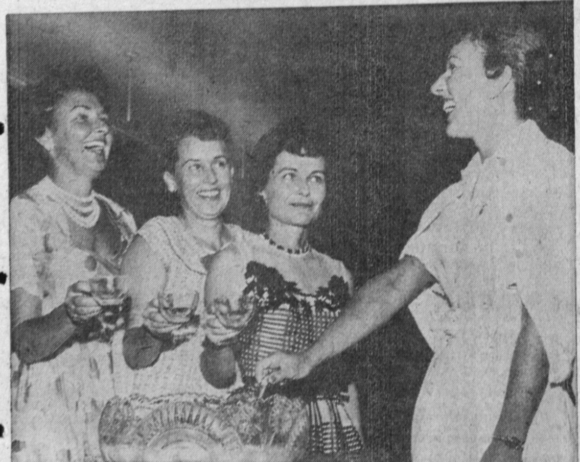
ACCENT ON PINK - For the Get Acquainted Tea at the Evelyn Carr Elementary School last week was complete even to the color of the dresses worn by the executive board. In charge of the arrangements for

ing Hills. Incentive for the ior college and high school the National Press Photo-