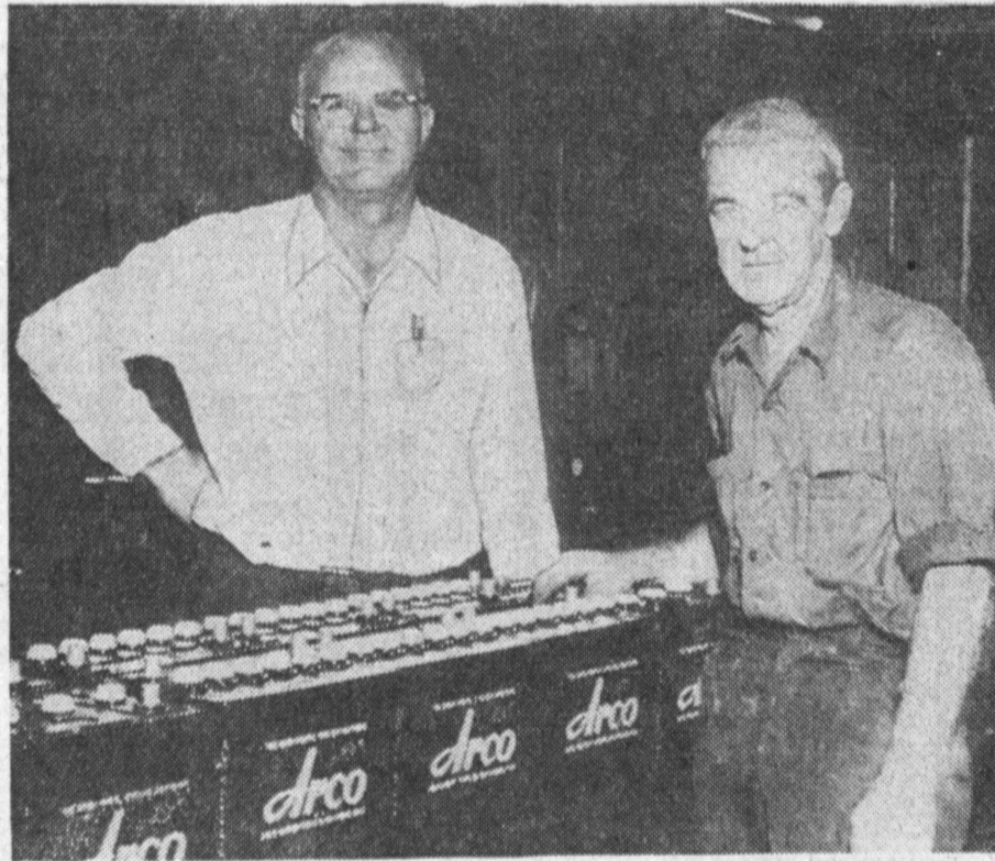
ARCO BATTERIES MFG. CO.

Now a primary course in aviation can be obtained for only $88 at Flightline Company located at the Torrance Airport. Flightline is an approved flight school. This will be great news for all who are anxious to learn to fly, but hesitant because of the cost. Your fee at Flightline includes a student license, a log book, and 7 hours flying time. All lessons are private and are given at the student's convenience. These have occasional night flights when scheduled for instruction or sight-seeing. These are the most reasonable lessons you will find in this area, so don't delay. But, flight instruction is not the only thing obtainable at Flightline Company. Co-owners A. D. Wittchell and Roy Gregory are also the California distributors of Forney Aircraft. They not only sell this fine aircraft, but they service it with great care. New and used aircraft are available. Then too, they offer charter service and banner towing. Flightline Company is open seven days a week from 9 a.m. to 6 p.m. Gregory urges everyone interested in aviation, with their children, to visit the Flightline Company offices, Pilot's Lounge, and hangars. You will receive a most hospitable welcome. The Flightline Company is located at the Torrance Airport, 3103 Pacific Coast Hwy., or you may call for more information, DA 6-0444.