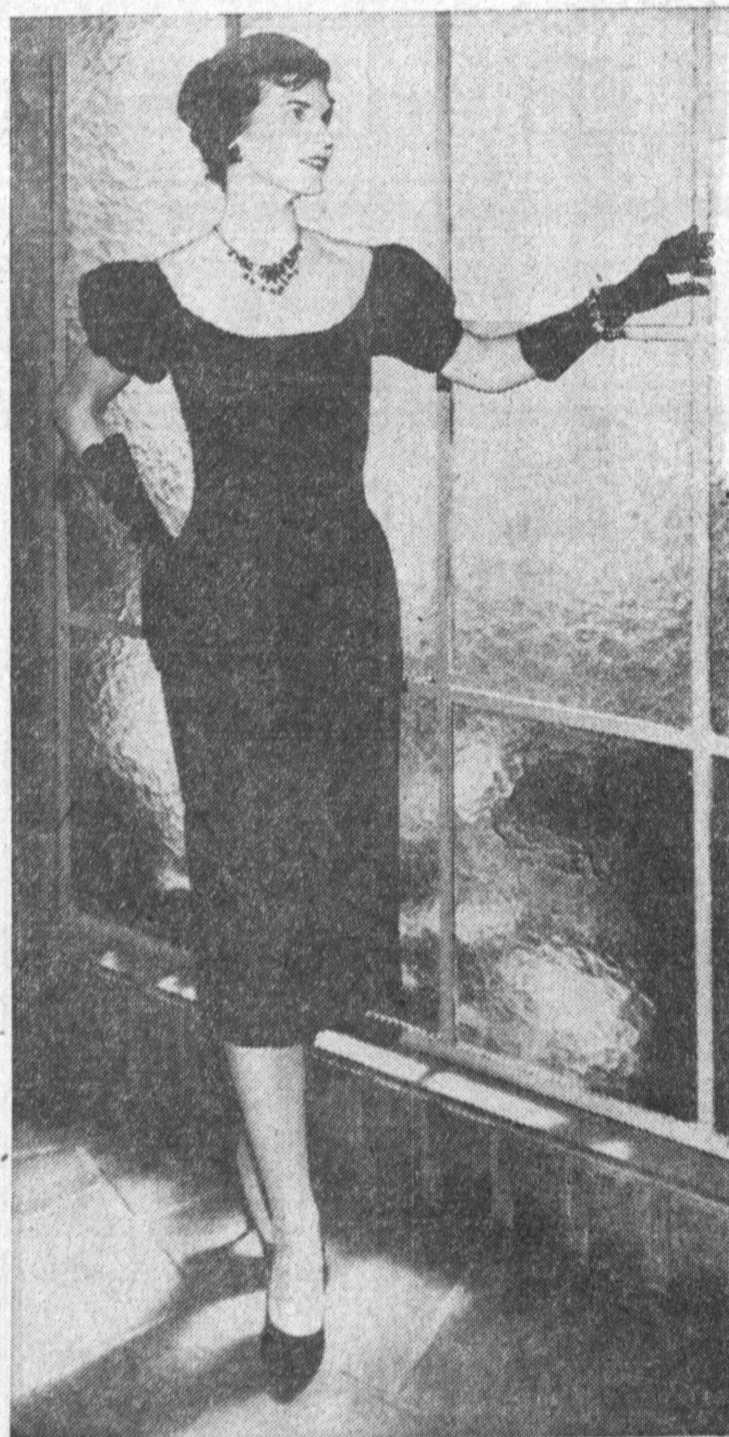
EXQUISITE—is the word for the Elsie Eberly original creation that will be shown at the St. James Fashion Guild this evening. The dress is a black satin, fully lined basic sheath with a scoop neckline and tiny puff sleeves. It features a built-in bra for a smoother fit.

Combine 1 3/4 cups finely chopped cucumber with 1/2 cup grated carrot, 1/4 cup vinegar and 3/4 tablespoon dill seed; toss to mix well. Put in jar; cover and chill several hours to blend flavors. Makes 2 cups.