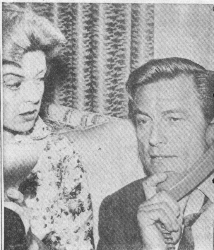
"MICHAEL SHAYNE"—The full-hour filmed mystery series—based on the detective novels of Brett Halliday and starring Richard Denning in the title role of the dangerous-living Shayne, premieres as an NBC-TV Network Friday night entry. Co-stars of the new "Michael Shayne" series include Patricia Donahue as Shayne's secretary, Lucy; Jerry Paris, Herbert Rudley and Gary Clarke. Novelist Halliday will be story consultant for the series.