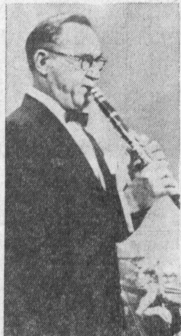
BENNY GOODMAN, the old King of Swing, will headline the Bell Telephone Hour Sept. 30 on Channel 4. Opening show will be in color.

1723 S. Catalina Ave., Hollywood Riviera FR 8-6555 • FR 8-9015