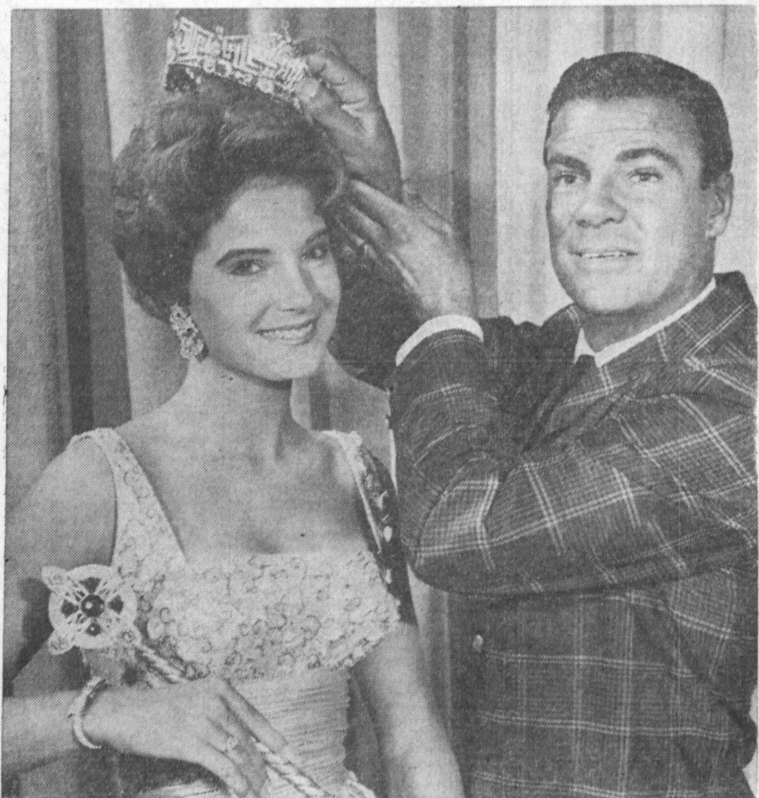
MISS AMERICA PAGEANT—Bert Parks and Lynda Lee Mead, this year's Miss America, will be on hand as Channel 2 televises events from Atlantic City, Saturday at 10 p.m.