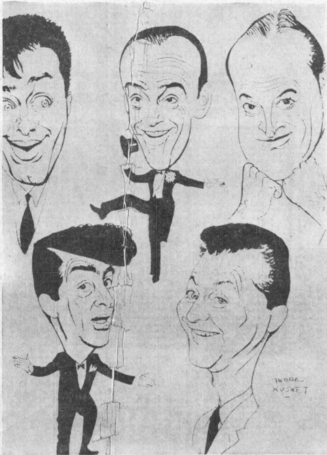
FIVE SPECIAL PEOPLE—Top stars will present many special programs on the NBC-TV network during the 1960-61 season. Already scheduled for one or more full-hour music-comedy-variety presentations each are (clockwise, from upper left) the star and host of "Jerry Lewis Show" programs; multi-Emmy Award winner Fred Astaire, whose "Astaire Time" colorcast Wednesday, Sept. 28, will be his third NBC-TV song and dance presentation; the veteran emcee who will preside over a succession of "Bob Hope Elvick Show" programs; actor-singer-comedian Donald O'Connor, who will star in his own special on Tuesday, Oct. 11, and Dino, singing star of several "Dean Martin Show" presentations for the new season. Numerous other specials are spotted through each week's schedule on NBC-TV.