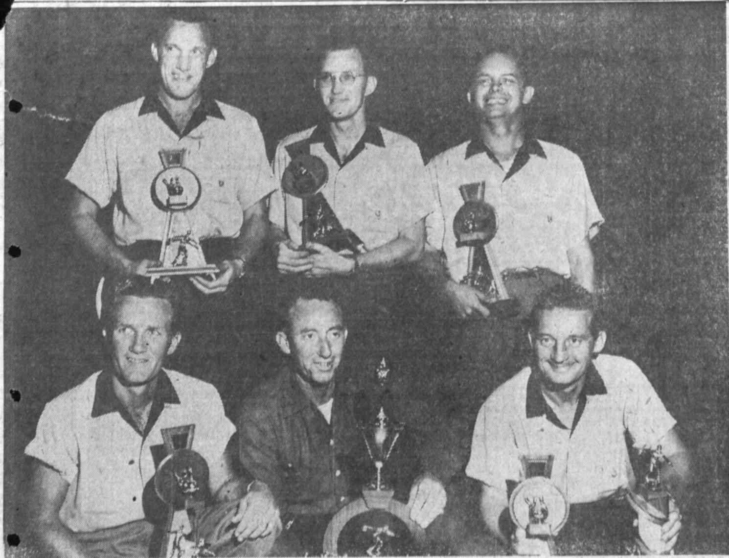
MONDAY COMMERCIAL LEAGUE BOWLING CHAMPS beam happily after receiving their coveted awards recently. Members of the Hunt Rambler Team they are, top row, left