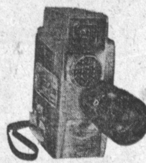
Revere Cine-Zoom Electric Eye-matic Camera