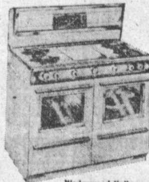
Wedgwood Holly Star Sapphire Range