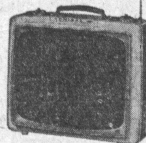
19" Admiral Wide-Angle Portable TV

—and many other valuable prizes— including a vacation in Las Vegas.