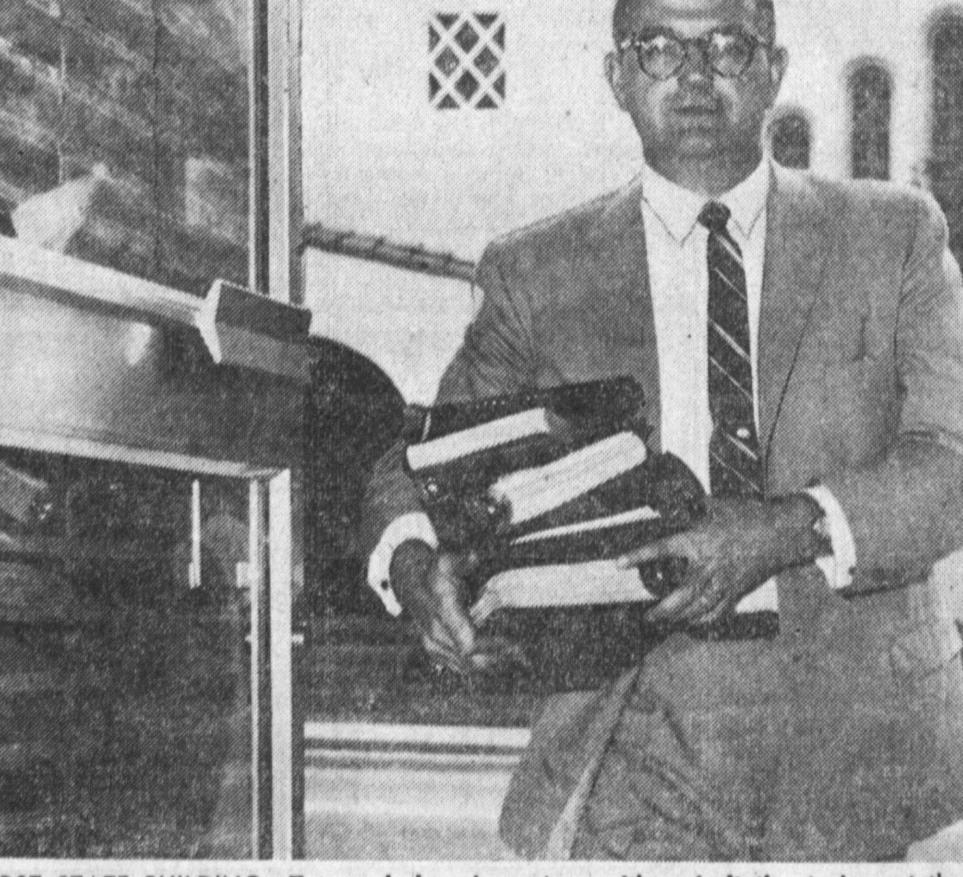
FIRST STATE BUILDING-Torrance's brand new Department of Employment building opens tomorrow, Friday, at 1220 Engracia

000 restaurant, bar and cof-10 a.m., at Redondo Beach enrollm