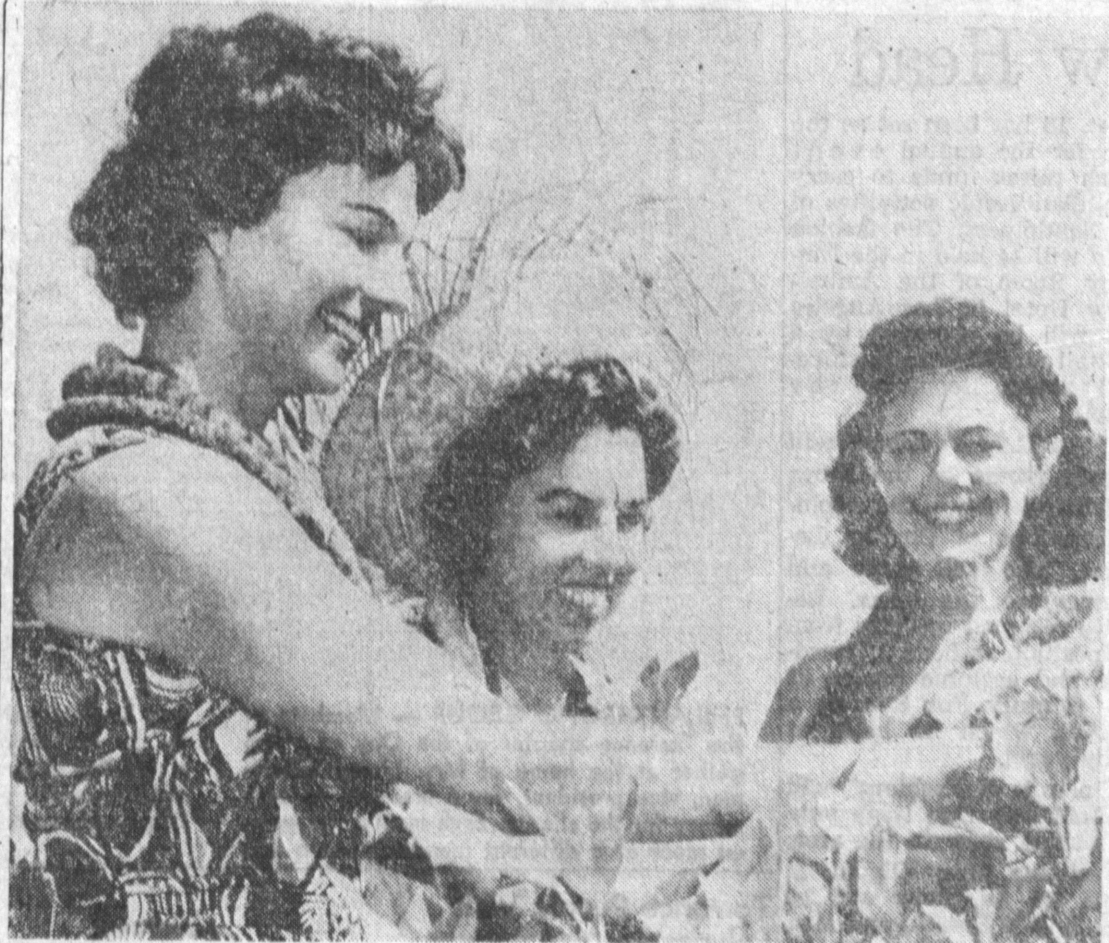
POLYNESIAN PARTY - Members of Alpha Delta Phi sorority and husbands met last night at a Polynesian gathering to highlight the summer. Readying for the event are (left to