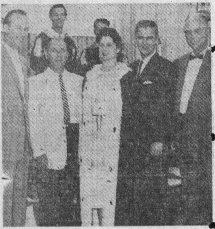
Princess Marcia Charms PTA Executives

the flick of a switch, the dial glows as a soft night light so you can find the phone easily in the dark. The Princess comes in attractive colors that are perfect for any room in your home-white, beige, pink, blue and turquoise. This new extension phone costs just pennies a day after a onetime charge. You can see and try it out at our business office, and you can order it there or through your telephone service man.