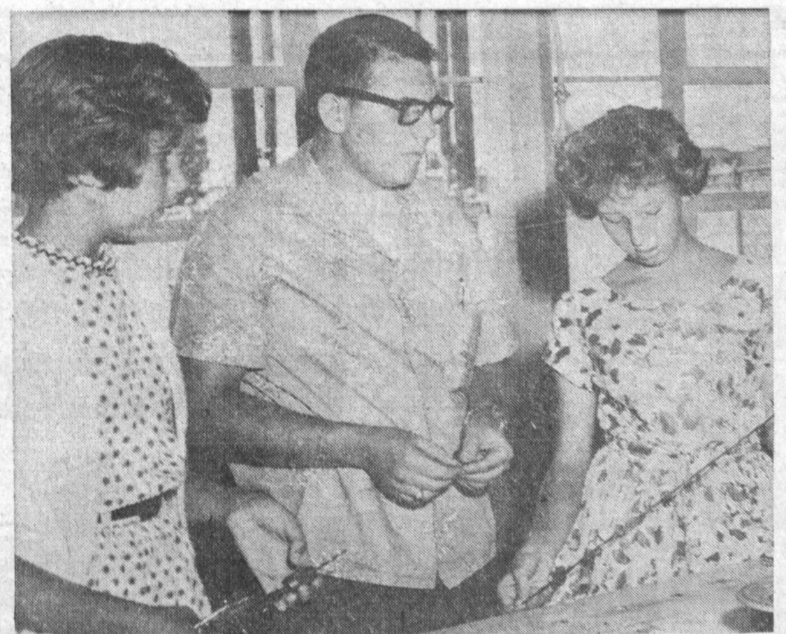
SUMMER SWITCH — Girls in a summer school class at Casimir Elementary School are getting an extra bonus this summer—shop instruction.