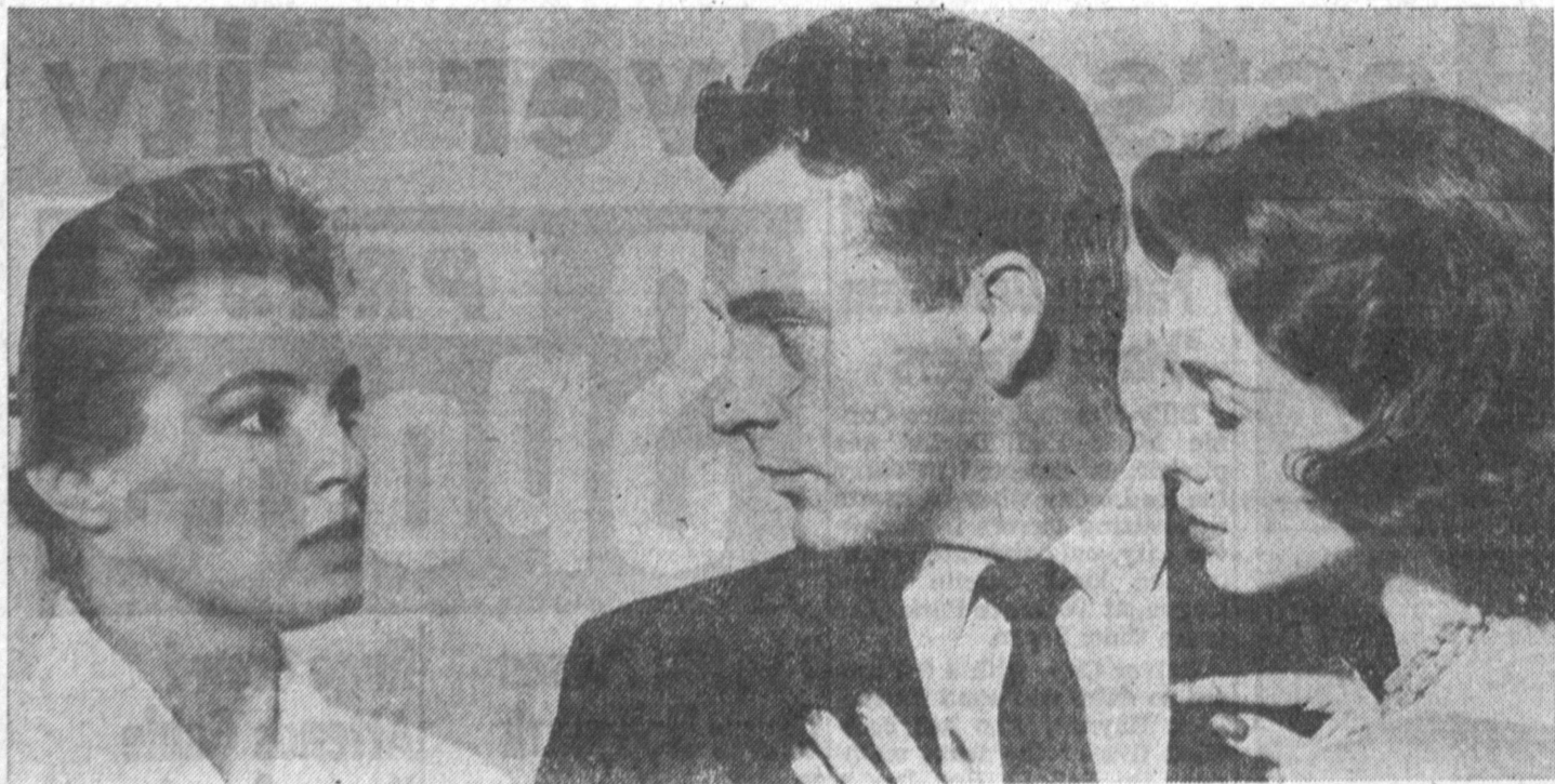
THE BRAMBLE BUSH, screening today and tomorrow at the Roadium Drive-in Theater, stars Barbara Rush, Richard Bur-