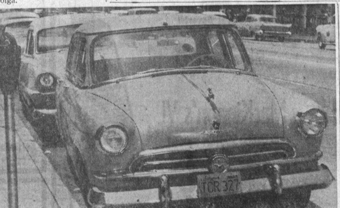
ONLY ONE OF ITS KIND in the United States, the "Volga," Russaian sports car which was smuggled out of Russia, will be