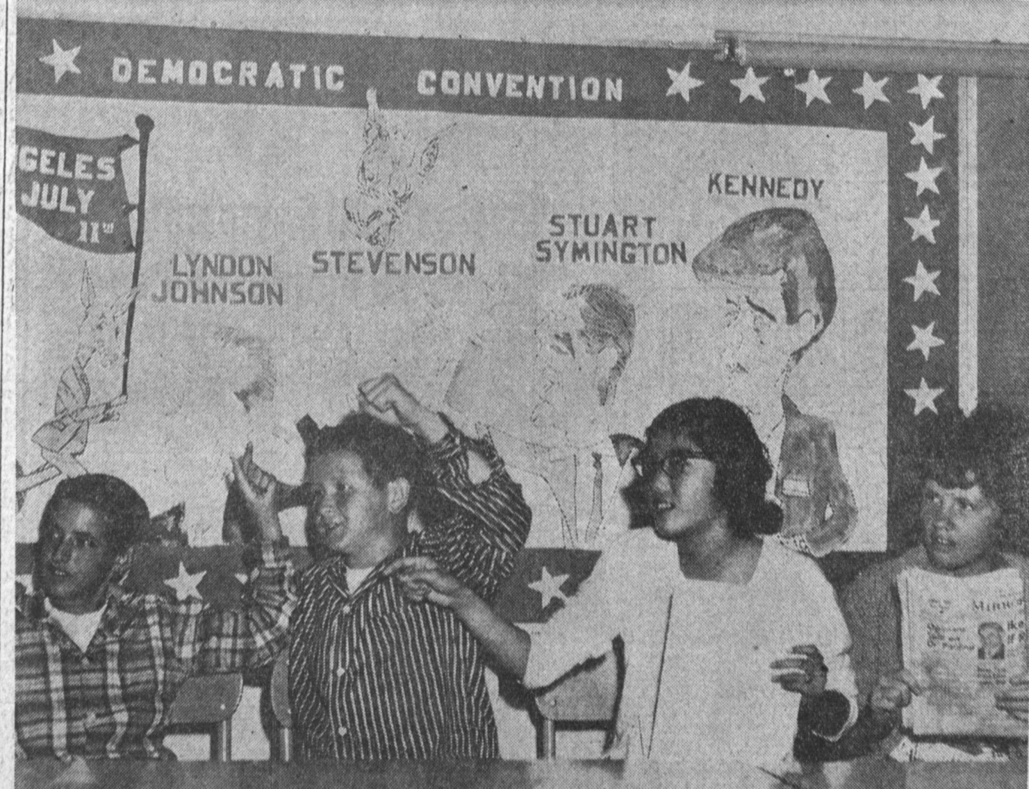
YOUNG POLITICIANS-In conjunction with the political actions of the Democrats and Republicans during conventionme, members of an Arlington Elementary School summer class are mimicking leading candidates during their study of

Persons wishing to attend $1000 for cities under 5000 the Democratic Convention population to $20,000 for cities with more than one-half in the Coliseum tomormillion population. The total row can do so by using the Hall Addition