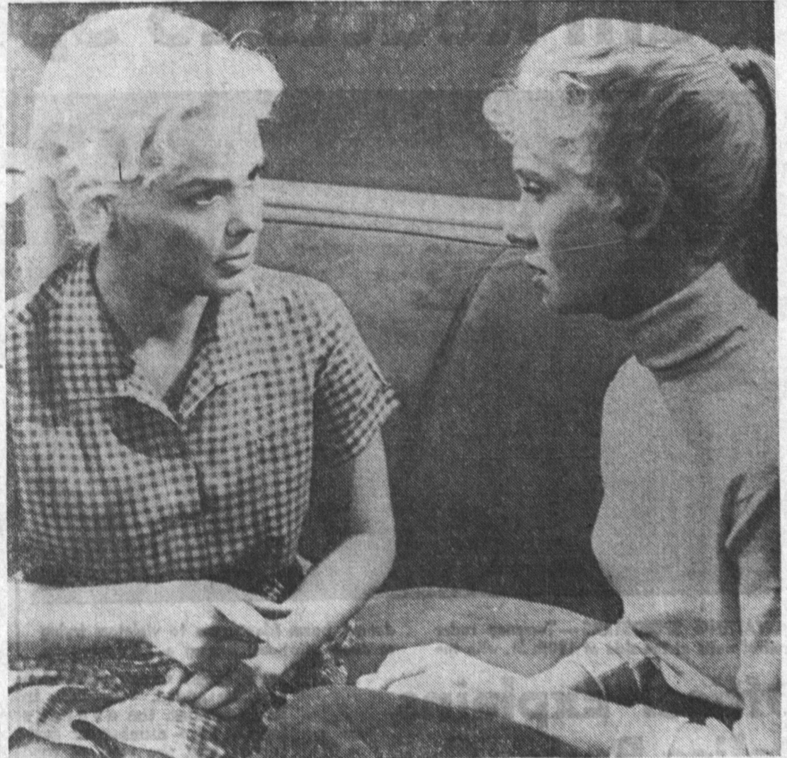
TENSE SCENE is from "Girls Town," screening today and tomorrow at Roadium Drive-In Theater. Companion feature is "The Mississippi Gambler" with Tyrone Power.

DRIVE-IN THEATRE Redondo Beach Blvd. DA 4-2664