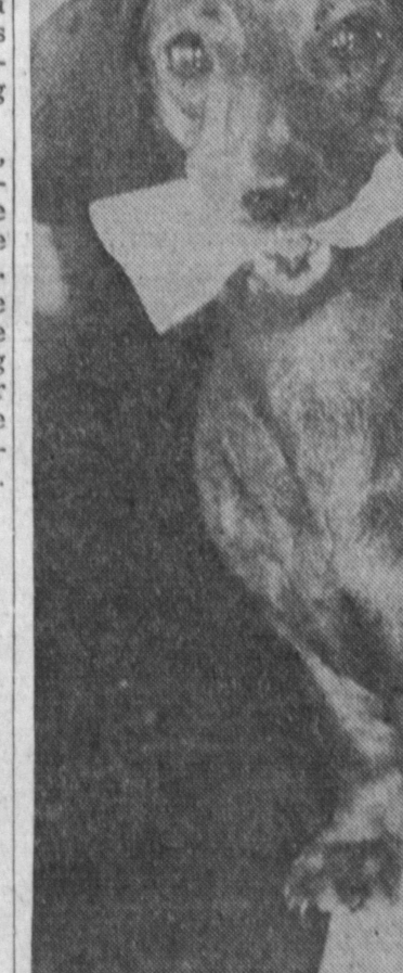
LOOK MOMMY, I paid my dog license fee, smiles a young canine as he proudly holds the evidence of his deed. Tomorrow is the deadline for licensing dogs over four months at City Hall.

Mailing of fees is possible by addressing requests to the pound office, Downey. Money orders or personal checks are accepted if made payable to the Los Angeles County Pound Department.