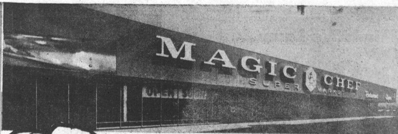
MAGIC CHEF MARKET. One of the largest in the world, the Magic Chef Market opens today in Torrance, at Hawthorne and Sepulveda in the Del Amo Shopping Center. The new market totals nearly 60,000 square feet, has over 35,000 square feet of sales area.