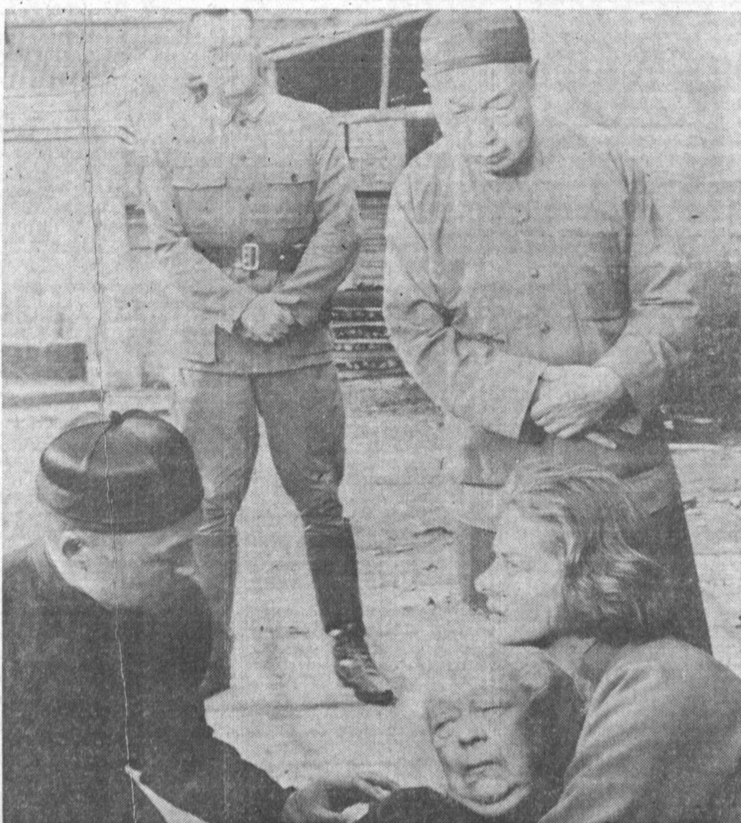
BERGMAN STARS—"Inn of the Sixth Happiness" is main feature on Radium Drive-in screen tonight through Saturday, along with "Black Horse Canyon," Joel McCrea