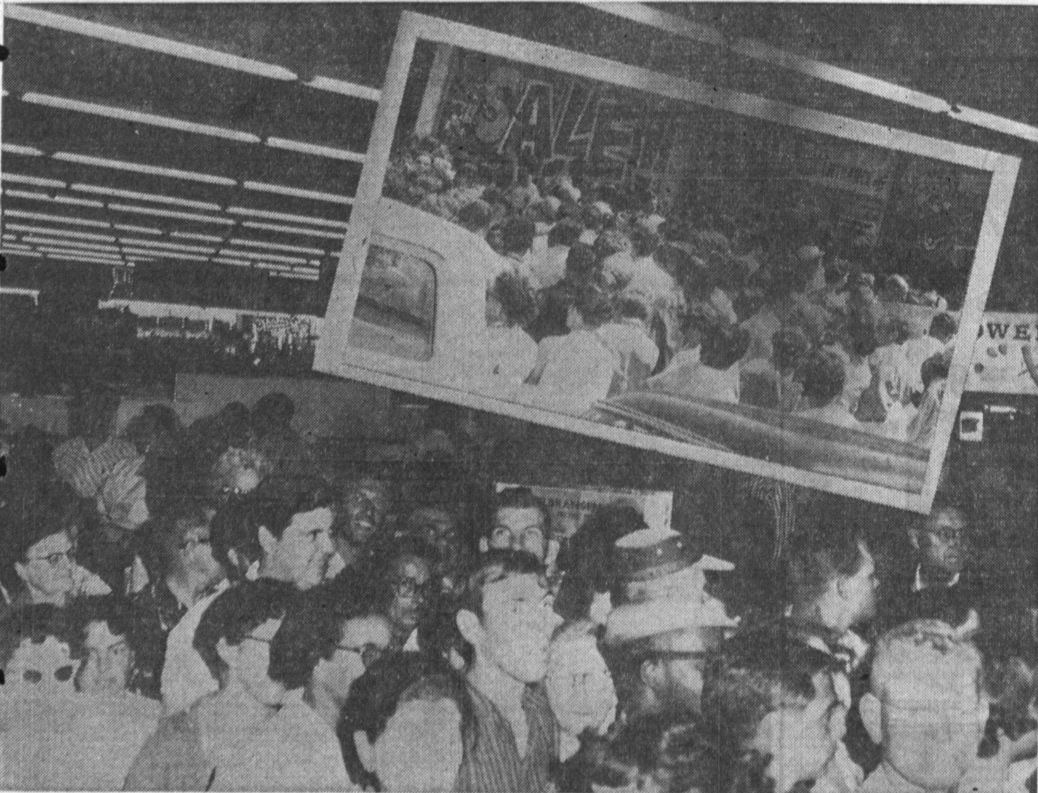
KRAZY DAZE SALE at Leonard's International in El Segundo attracted more than 60,000, according to estimates of store officials. Sale started Thursday and is still in progress. Large photo shows huge throng crowded indoors seeking items that ranged from $1 radios to $9 refrigerators. Insert is partial view of the 4000 waiting to get in when the store opened Thursday morning.

ing items that ranged from $1 radios to $9 refrigerators. Insert is partial view of the 4000 waiting to get in when the store opened Thursday morning.