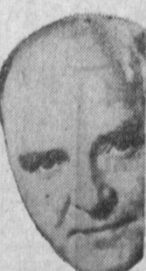
IN SAN PEDRO 704 S. PACIFIC AVE.

Come in, write, or phone for your copy of DENTURE NEWS. In the 18 subjects covered you will find something helpful, even if you go elsewhere. It is yours for the asking. EASY CREDIT WITH NO INTEREST CHARGED. No credit cards or special financing needed. Same price cash or credit. Wait 45 days for your first credit payment, and take two years to pay.