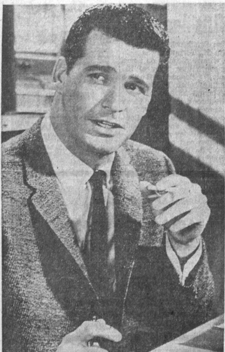
CURRENT—Now playing at Radium Drive-in is "Cash McCall with James Garner and Natalie Wood. Co-feature is "Tribute to a Bad Man" in color with James Cagney, Irene Papas.