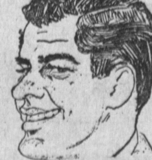
at PAUL'S Chevrolet 1640 Cabrillo,